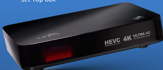
Set Top Box